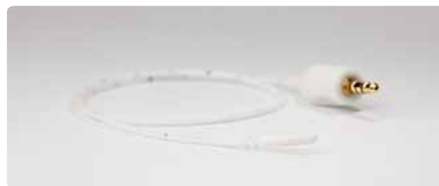
Figure 3. Close up of the RayPilot transmitter