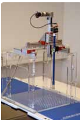
Figure 2. Automatic 3D-moving device for testing random positions.

The Micropos Medical RayPilot 4D localization system generation 1 has earlier been used in a pilot in vivo technical feasibility study (ref. 2, poster P-1077 ESTRO 2008). In this study an electromagnetic positioning marker was temporarily inserted in urethra, and the transponder position was determined with a 3D resolution of 1.7 \pm 1.0 mm (as compared to 2 orthogonal 2-D radiographic positioning). The system has now been developed with a reduced transmitting implant diameter, a significantly improved positioning algorithm, an optimized antennae system with e.g. 33% increase of the number of receiving antennae. The system has been evaluated in vitro using an automatic 3D-moving device in order to test a large number of random positions (Fig.2).