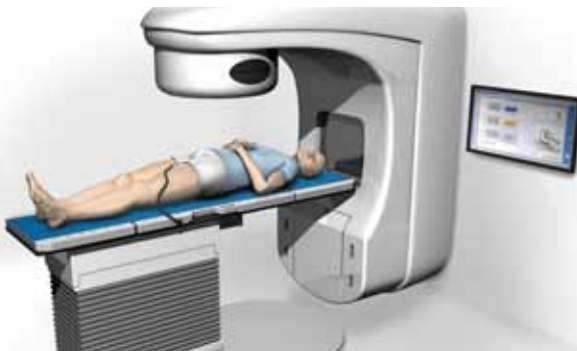
Figure 1. Illustration of the Micropos 4DRT system on a linear accelerator table.

Electromagnetic positioning was first described by Lennernäs & Nilsson 1995. In this technical note we describe the latest development of the Micropos 4DRT RayPilot system. It is an electromagnetic positioning system being developed to provide accurate, precise, objective, and continuous target localization throughout the course of clinical radiotherapy (Fig.1). It is not X-ray dependent and can be used with or without IGRT techniques. The system uses a non-permanent implant and can be used on existing treatment table tops.